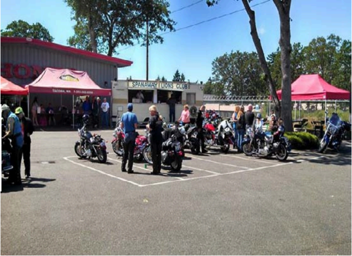
2014 Poker Run, June 7, South Bound Honda

A BIG THANK YOU TO LAKEWOOD FORD, FIR LANE FUNERAL HOME FOR THEIR DONATIONS